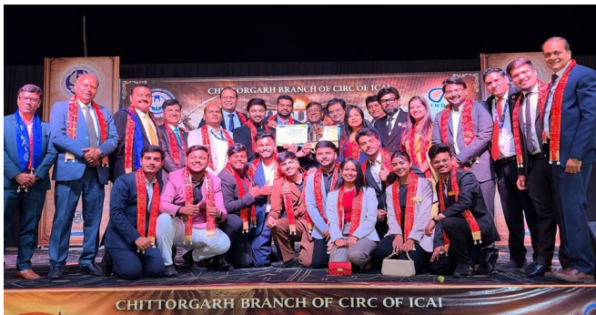
CHITTORGARH BRANCH OF CIRC OF ICAI